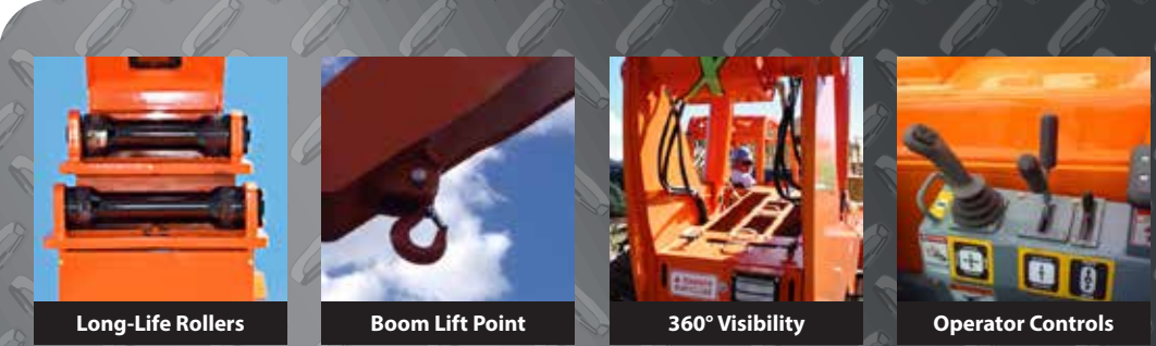
Long-Life Rollers Boom Lift Point 360° Visibility Operator Controls